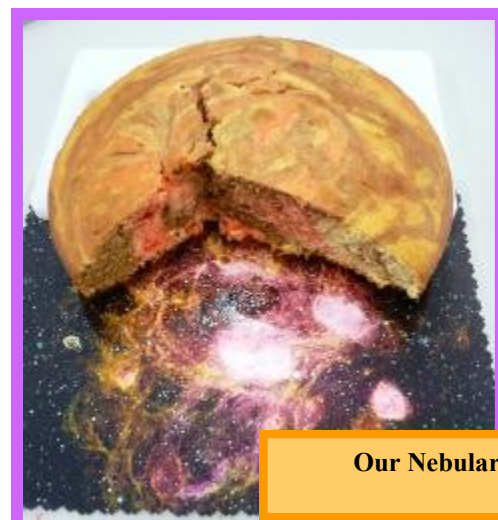
Our Nebular cake