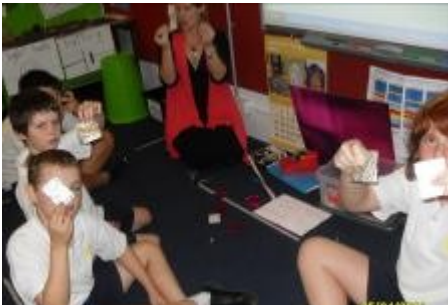
Creating a pressure switch with aluminium foil.