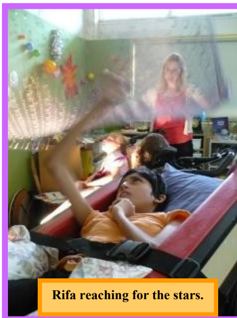
Rifa reaching for the stars.